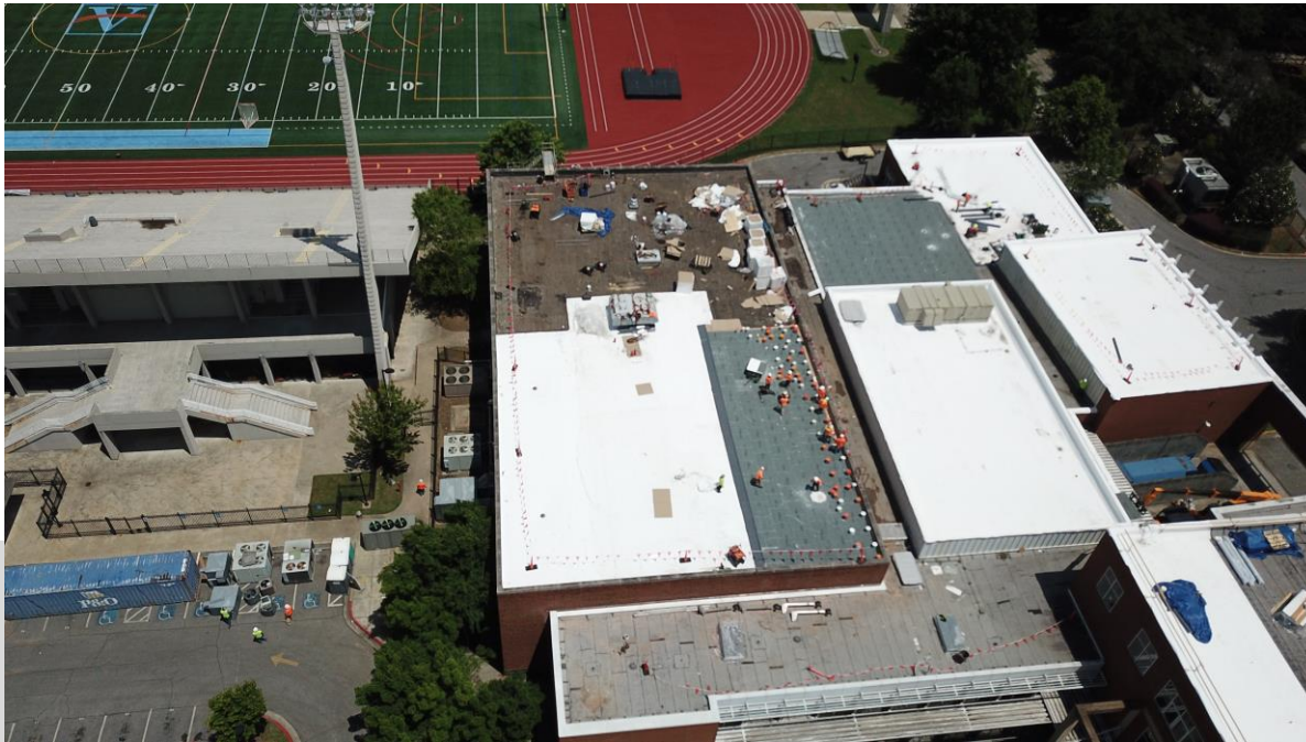
Installation of Theater and 8 th Street Building Roof