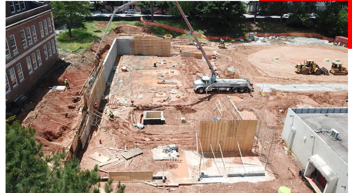
Pouring remainder of concrete at South Wall of New Addition